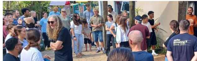
BE The Weekend - 2025

BE (Beyond Experience) The Weekend is at Living Springs, Allandale. It's a bit of a 'fast n' furious' weekend for up to 65 attendees but an important time for new BE'ers to connect with their Kaiārahi (mentors).