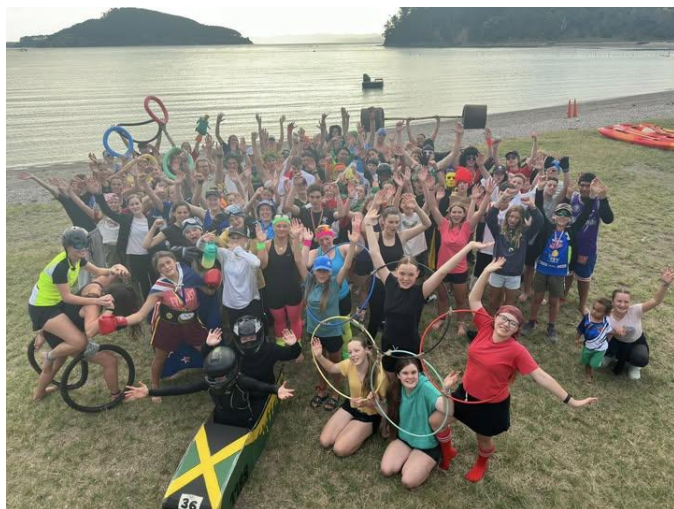
Pōnui Junior, January 2024

“...that your joy may be made full and complete and overflowing”