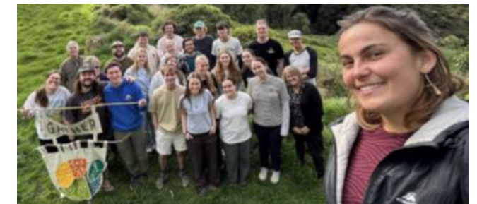
Image: GATHER South August 2025

Thank you to all those involved with GATHER our camp leader training days.