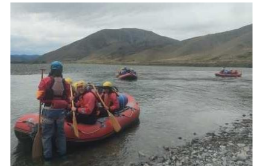
E3 Canterbury, Dec 2024