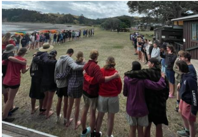
Pōnui Junior, Jan 2025. Campers starting camp with prayer & praise!