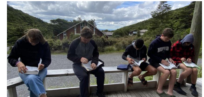
Bible engagement on Summer Supreme. SU Adventure Lodge behind campers.